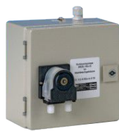
Connecting box for 1 DSR25-ATEX pump