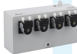
Connecting box for 4 DSR25-ATEX pumps